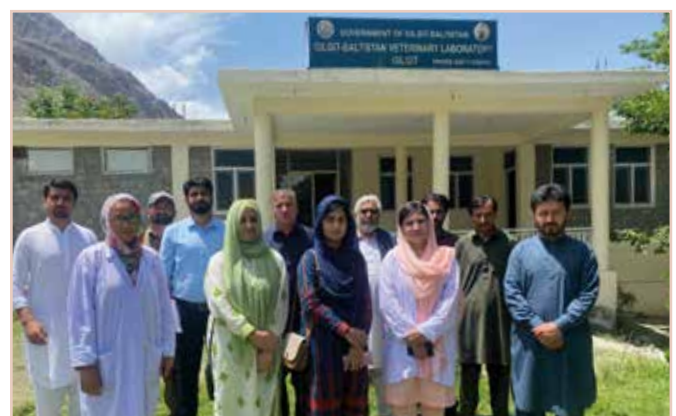
Gilgit Baltistan Veterinary Laboratory, Gilgit Livestock and Dairy Development Department Gilgit Baltistan

The initial findings of the activity revealed that, in the animal of activity explored that, in the animal health sector, the majority of peripheral laboratories have basic capacities to undertake the identification and AST of bacteria. However, this provides an opportunity to build a